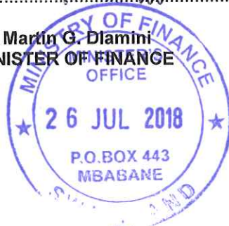
Martin G. Dlamini MINISTER OF FINANCE